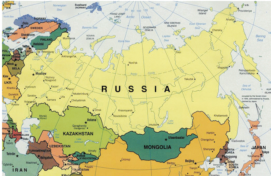
Figure 1. Map of Russian Federation

under the average conditions of overcast, considering anisotropism of the distribution of scattered radiation.