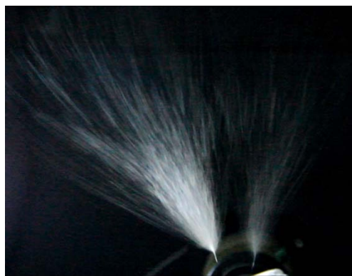
Figure 1. The spinning process of small bubbles in liquid membrane

A 7 wt.% polyvinyl alcohol (PVA) solution is used in our experiment, the applied voltage is 15 kV and the distance between the solution surface and the metal receiver is 30 cm. All the experiments were carried on at temperature 20 degrees with a relative humidity of 53%. The spinning process was performed on the bubbfil spinning equipment (Nantong Bubbfil Nanotechnology company limited). In the spinning process thin film is produce to form uniform micro or nano bubbles. The size of produced bubbles mainly depends upon the thickness of the produced film. The spinning process is illustrated in fig.1, where we can see millions of jets, which are solidified to nanofibers after solvent evaporation, fig. 2, which shows the morphology of the obtained uniform nanofibres observed by field emission-scanning electronic microscopy (S-4800, Hitachi Ltd., Japan).