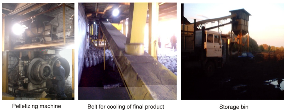
Figure 3. Basic components of the facility

the pellets and for that purpose it is equipped with armor for air circulation and de-dusting with air-cyclone (11) and fan (12). Basic elements of facility are presented on fig. 3.