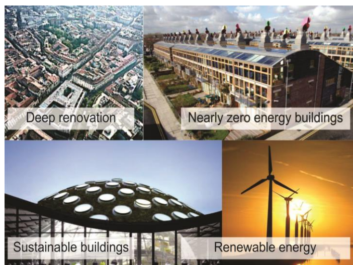
Figure 4. Challenges in the construction industry

The challenges in EU construction industry go through concepts like deep renovation, nearly zero-energy buildings, sustainable buildings, renewable energy, fig. 4. These concepts reflect in many research programs financed by the European Commission.